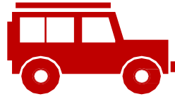
5-Seat Station Wagon Passenger M1