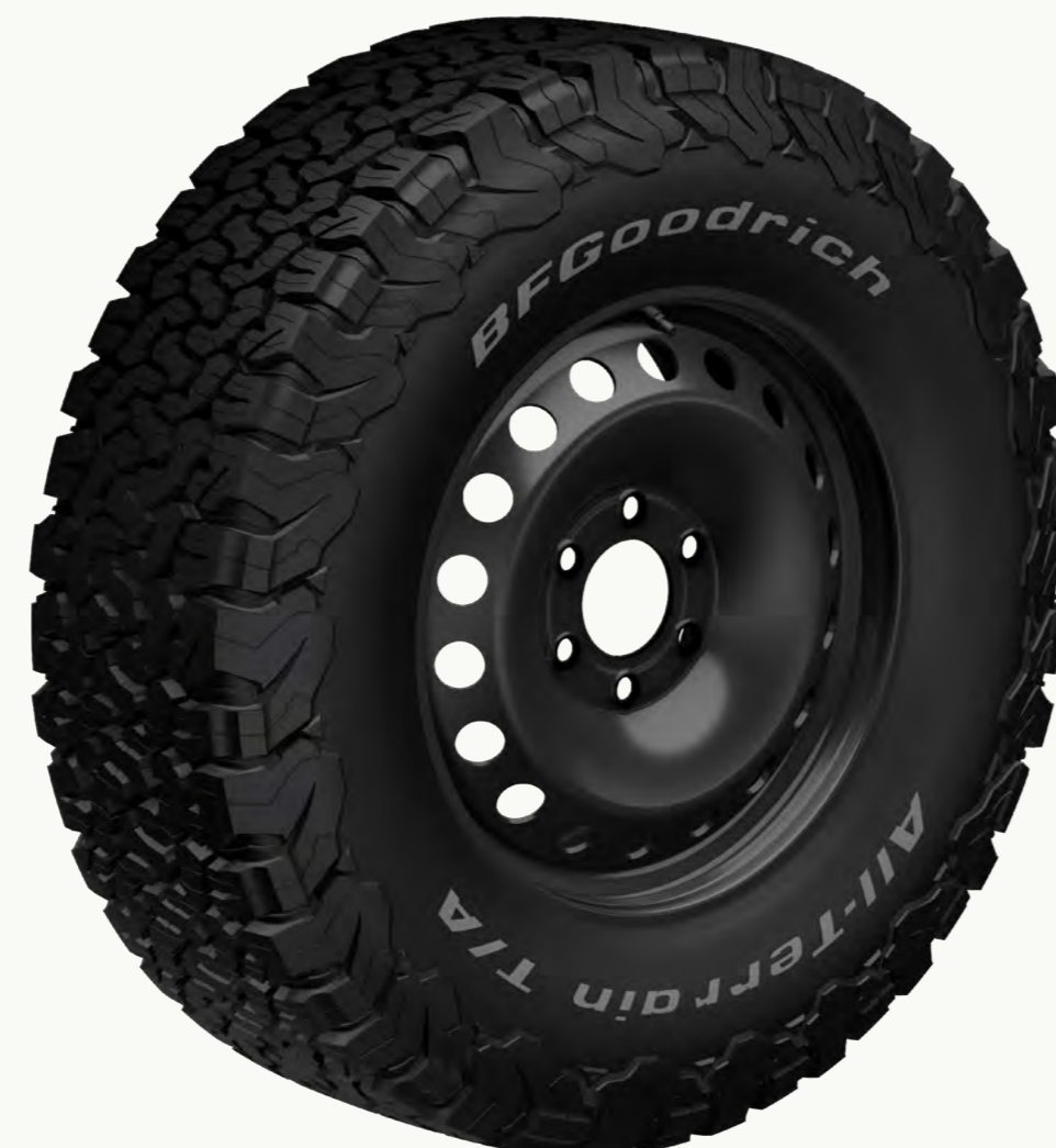
17" RIM - LT265/70R17 121/118S 18" RIM - LT255/70R18 117/114S