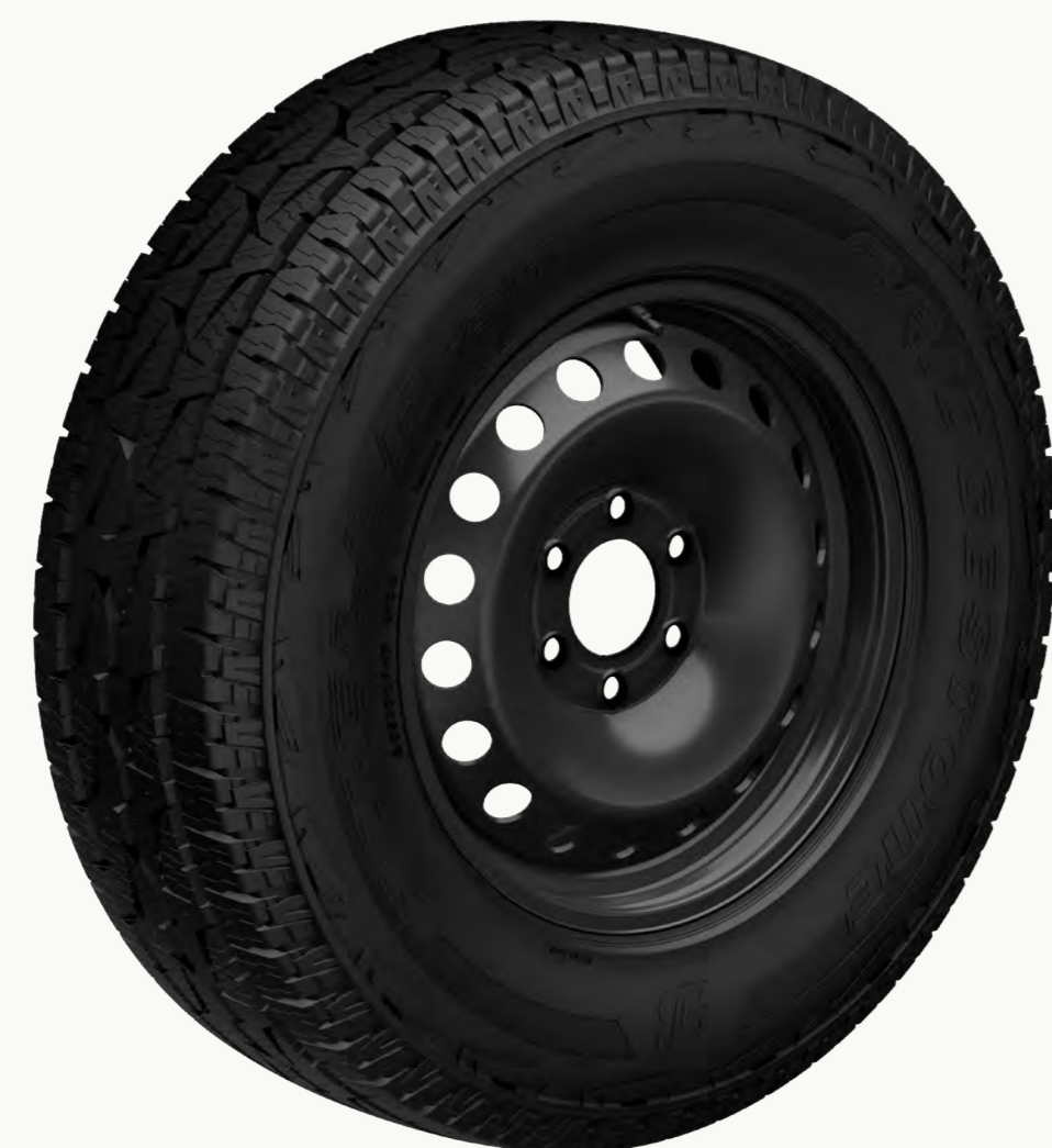
17" RIM - 265/70R17 XL 116S 18" RIM - 255/70R18 XL 116S