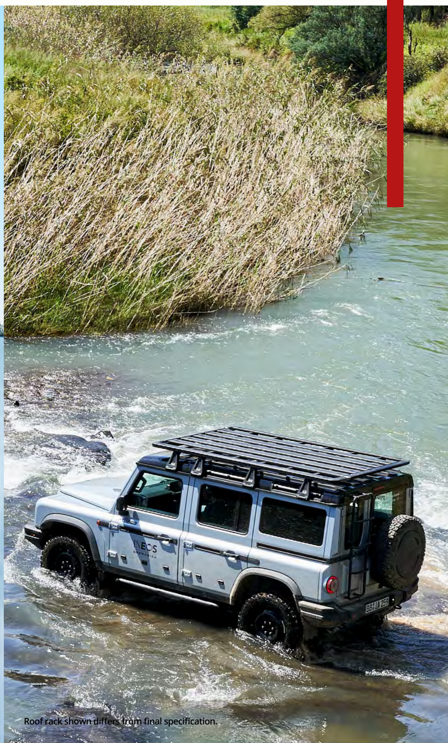
Roof rack shown differs from final specification.