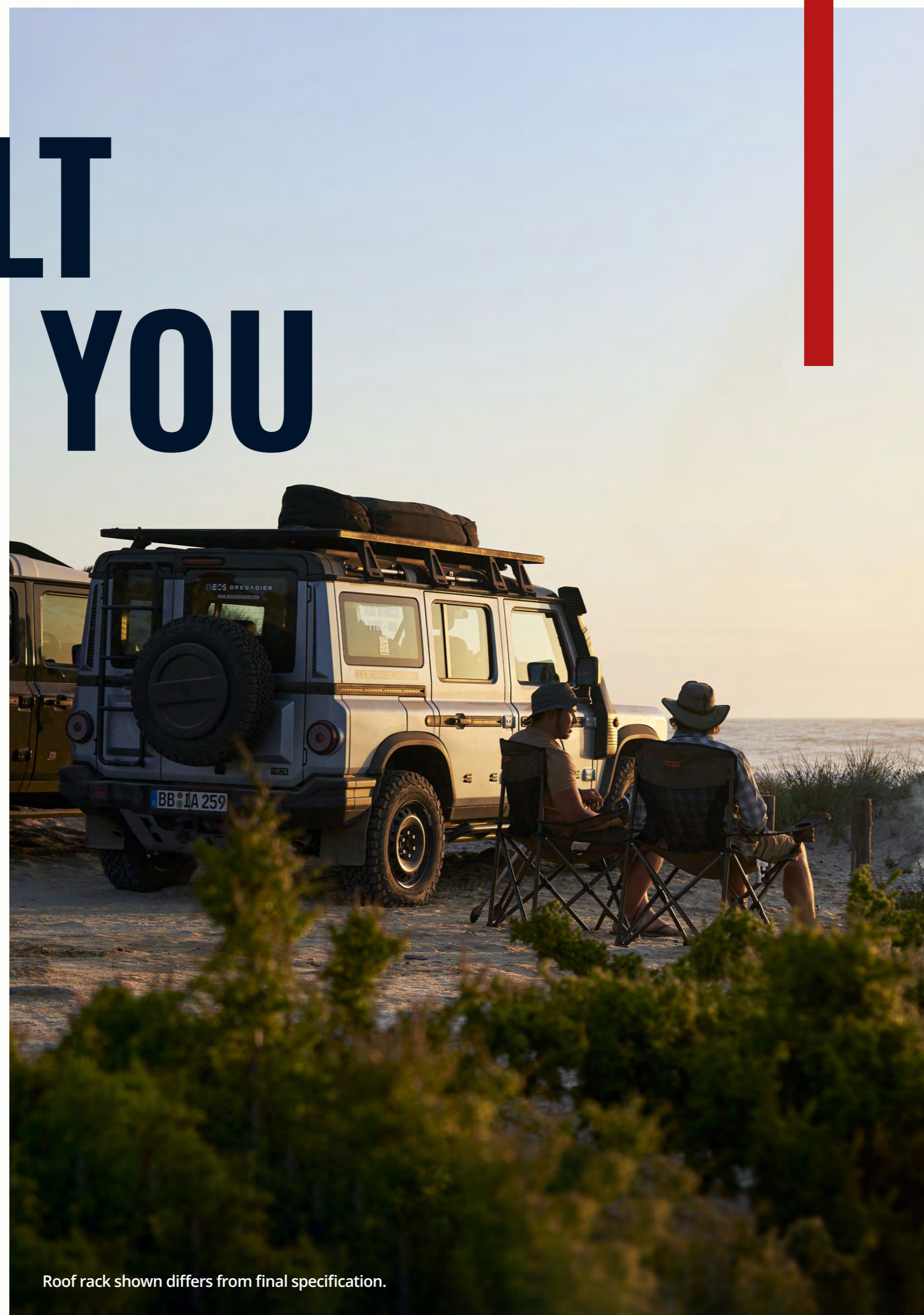
Roof rack shown differs from final specification.